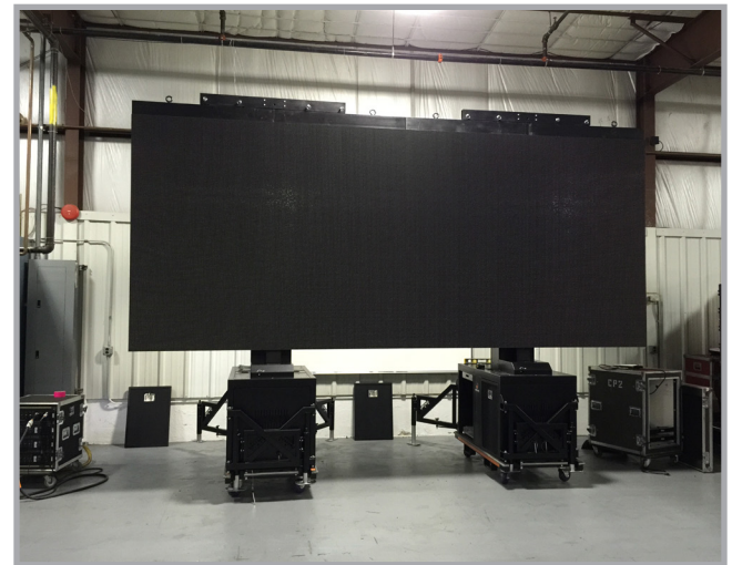
Not Actual Screen Size, picture shown for visual reference only